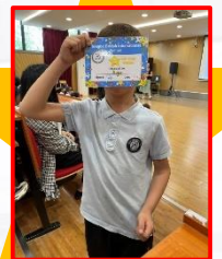
Star of the Week