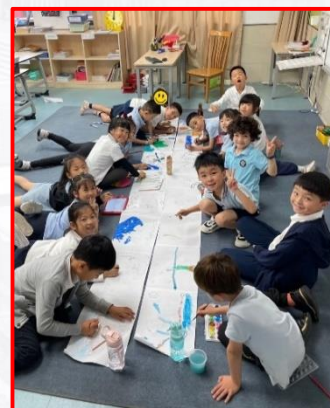
Long Painting about Nature