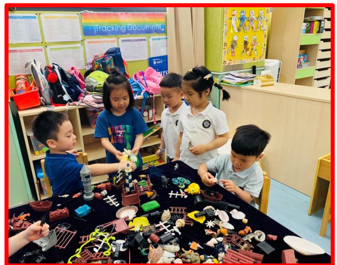
Sea Animal Role Play