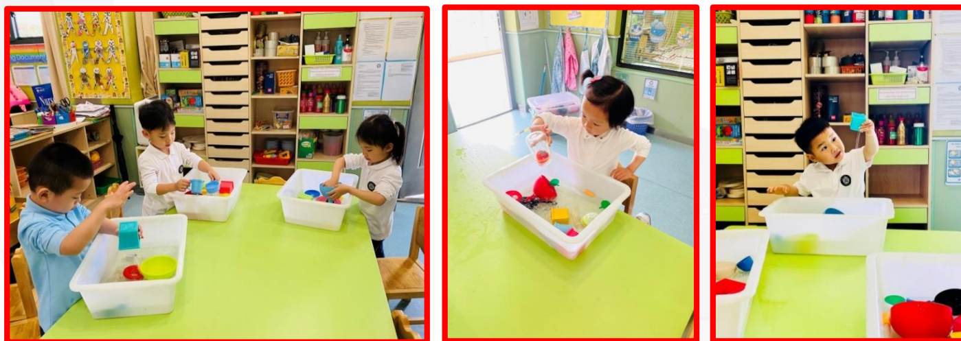
The children have fun with water play!

There has been a lot of fun with indoor water play. The addition of some sea creature adjuncts and different shaped and sized containers has provided many different learning opportunities for different groups of children. Some of them have used the containers as a means of engaging in creative and sometimes quite dramatic play scenarios and dialogue between themselves, for example: "ice-cream for you, ok?" The same adjuncts have also provided teaching opportunities to explore literacy and numeracy concepts, for example: sorting and classifying according to size, color, shape or type, counting the fish, identifying which one is the smallest and which one is the biggest. Play like this also provides countless opportunities for the children to socialize, refine motor skills (pouring), to ask questions, to find out, to learn and to make sense of their world.