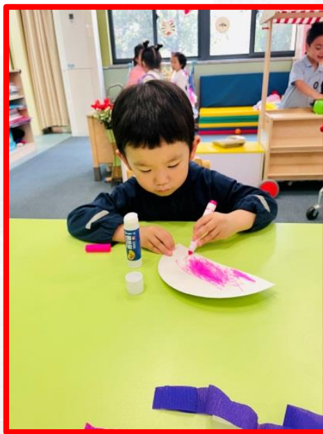
Jelly Fish Craft