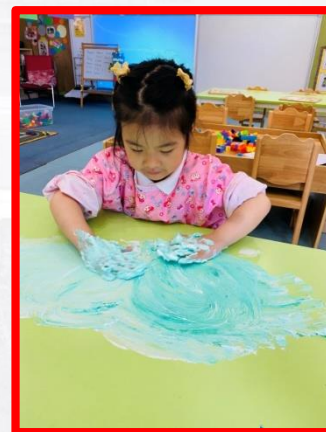
Shaving Cream Painting