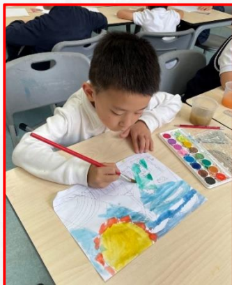
Art of Shapes

In art we made an art project of splitting and reforming a cake. Children designed their cakes first, cut their cakes into pieces, and then reformed the cakes to be presented as a new piece of artwork. As you can see from the above artworks, children were very brave in using colours and imaginative when reforming the pieces. In the end, they wrote a caption at the back of their works to explain the name of the cake and what their cakes are made of.