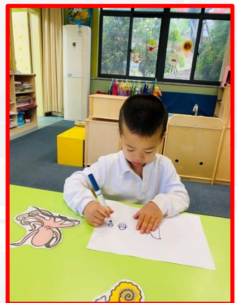
Drawing Sea Animal